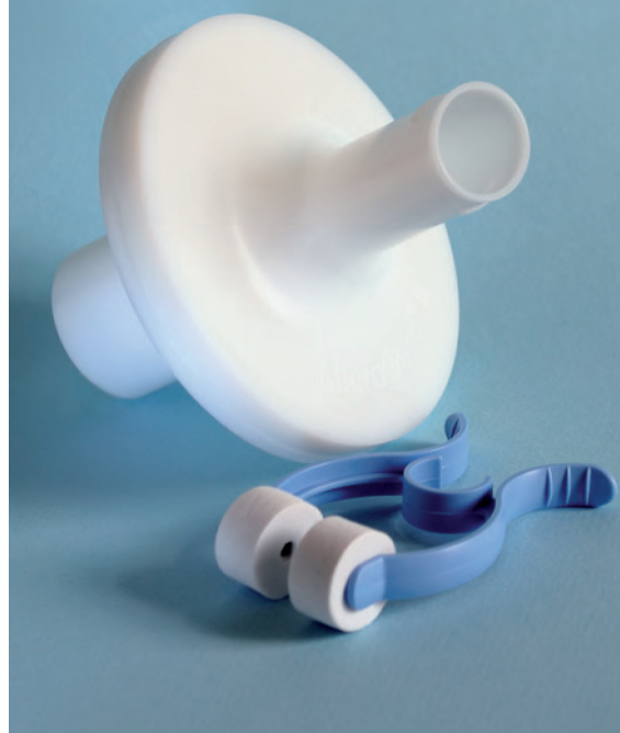
Filter kit MG IIC (MicroGard IIC filter + disposable rubber mouthpiece + noseclip)