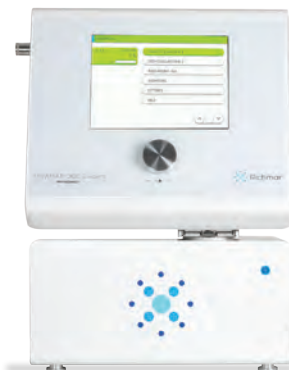
RM02037 Hivamat 200 Evident