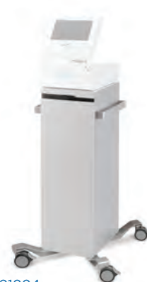
RM01004 Evident Trolley