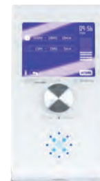
RM01009 Hivamat 200 Portable