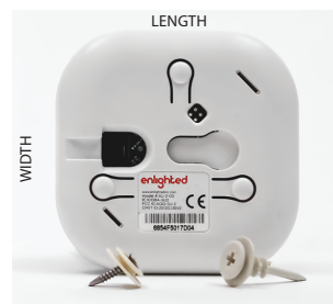
The Enlighted Smart Sensor