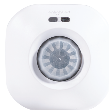
The Enlighted Smart Sensor

Lighting Technology Compatibility. The Enlighted Smart Sensor can send dimming controls to standard 0–10V ballasts and drivers for LED, fluorescent, HID, induction, or plasma fixtures and on/off controls for all types of fixtures and relays.