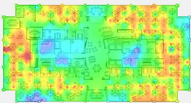
Bldg 41, San Francisco – Energy Consumption Map Lighting System – 08:00 - 09:00