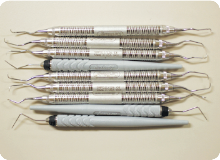
Figure 3. Representative instruments after ultrasonic cleaning with the Sani-Soak Ultra Enzymatic Cleaner System .