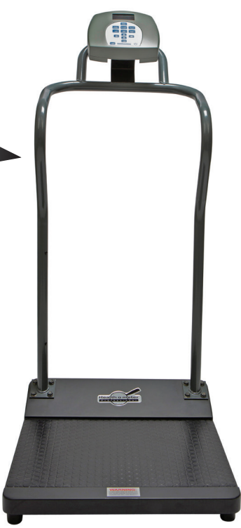
LIVE HANDRAILS FOR PATIENT STABILITY

Safe patient handling and reducing costs associated with inpatient falls are primary concerns for healthcare providers