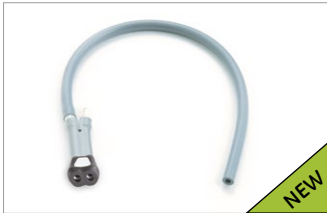
Wall Manometer Adapter only Includes adapter with DINAClick connector and 13" tubing (No coiled tubing, no bulb and valve) Part # 2059289-002 (5/Pk)