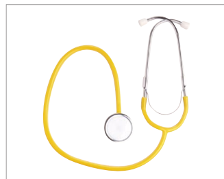
Stethoscope, Disposable Single-Head, Yellow Tubing