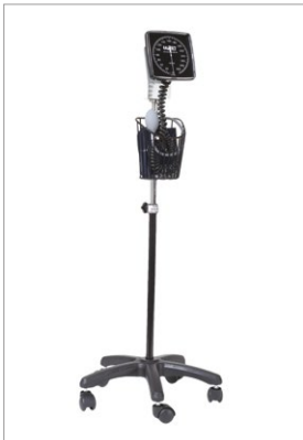
Wall Manometer System with Rolling Stand Includes wall gauge, coiled tubing, adapter bulb and valve, adult DURA-CUF,* and rolling stand