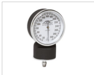
Pocket Aneroid Gauge, Reusable, Black Includes gauge only