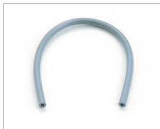
Tubing, Gray Unfitted

13" long, 5/32" ID Part # 300967 (10/Bx) 22" long, 1/8" ID Part # 330074 (1/Bx)