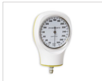
Pocket Aneroid Gauge, Disposable, White Includes gauge only