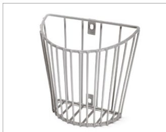
Wall Basket, Gray