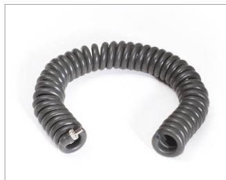
Coiled Tubing 8 ft, Gray