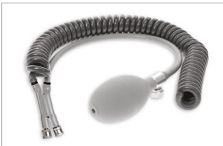
Wall Manometer Adapter Includes coiled tubing, adapter with female screw connectors, bulb and valve Part # 2349 (5/Bx)