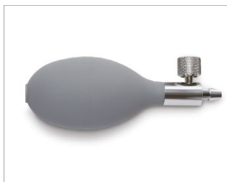
Bulb and Valve, Reusable Gray Includes bulb and valve only