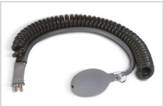
Wall Manometer Adapter Includes coiled tubing, adapter with male submin connectors, bulb and valve Part # 2348 (5/Bx)