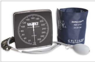
Wall Manometer System Includes wall gauge, coiled tubing, adapter, bulb and valve, and adult DURA-CUF*

Products included in this catalog are not made with natural rubber latex.