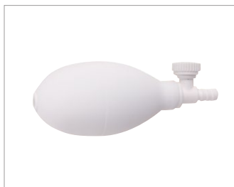
Bulb and Valve, Disposable White Includes bulb and valve only