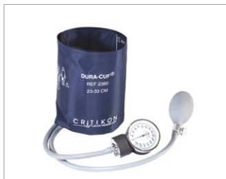
Pocket Aneroid Gauge Inflation System, Reusable

Includes pocket gauge and adult DURA-CUF with bulb and valve