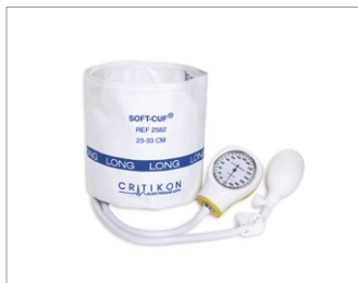
Pocket Aneroid Gauge Inflation System, Disposable

Includes pocket gauge and adult long SOFT-CUF* with bulb and valve