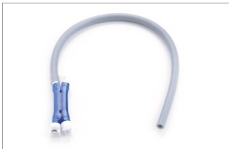
Wall Manometer Adapter only Includes adapter with male submin connectors and 13" tubing (No coiled tubing, no bulb and valve) Part # 330075 (10/Pk)