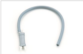
Wall Manometer Adapter only Includes adapter with male slip luer connectors and 13" tubing (No coiled tubing, no bulb and valve) Part # 300856 (10/Pk)