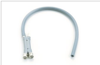
Wall Manometer Adapter only Includes adapter with female screw connector and 13" tubing (no coiled tubing, no bulb and valve) Part # 330076 (10/Pk)