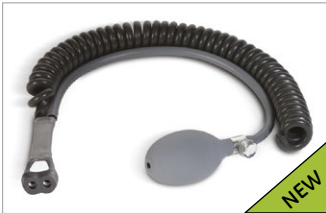
Wall Manometer Adapter Includes coiled tubing, adapter with DINAClick* connector, bulb and valve Part # 2059289-001 (5/Bx)