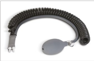
Wall Manometer Adapter Includes coiled tubing, adapter with male slip luer connectors, bulb and valve Part # 002342 (5/Bx)