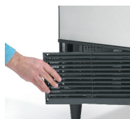
Front Air Filter