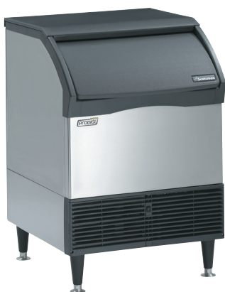
CU1526 / CU2026