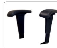
Articulating Arm Rests Part#: P-6000-D