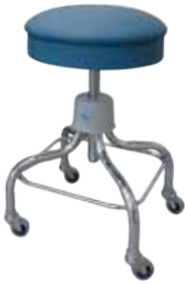
● P-36 ● T-36