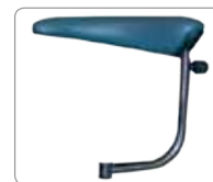
Procedure Rest Part#: P-6000-PR