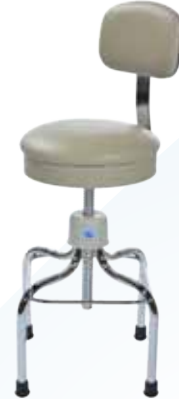
● P-39 ● T-39