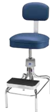
● P-55 ● T-55