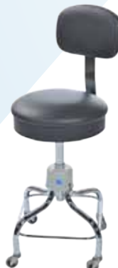
● P-51-R ● T-51-R