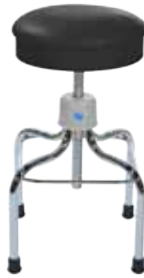
● P-38 ● T-38