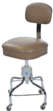
● P-51 ● T-51