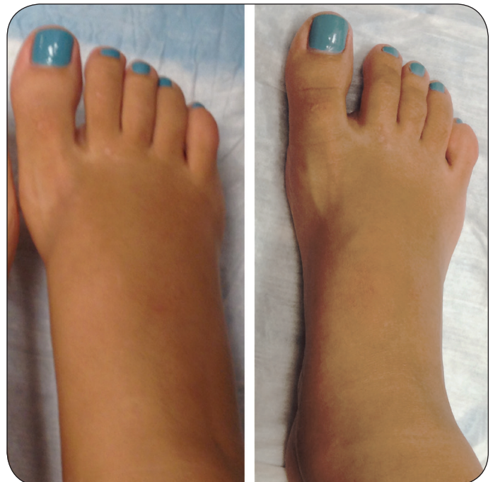
Prior to first Aquaroll® treatment.