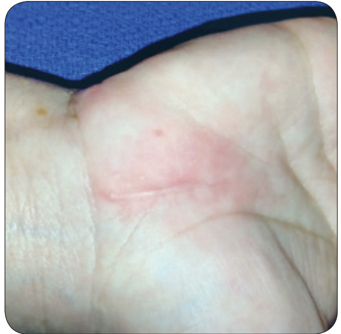
Prior to first AquaRoll® treatment.

One year post-operative visit revealed patient continued to function at full-duty capacity as a sous chef without complaints and was discharged.