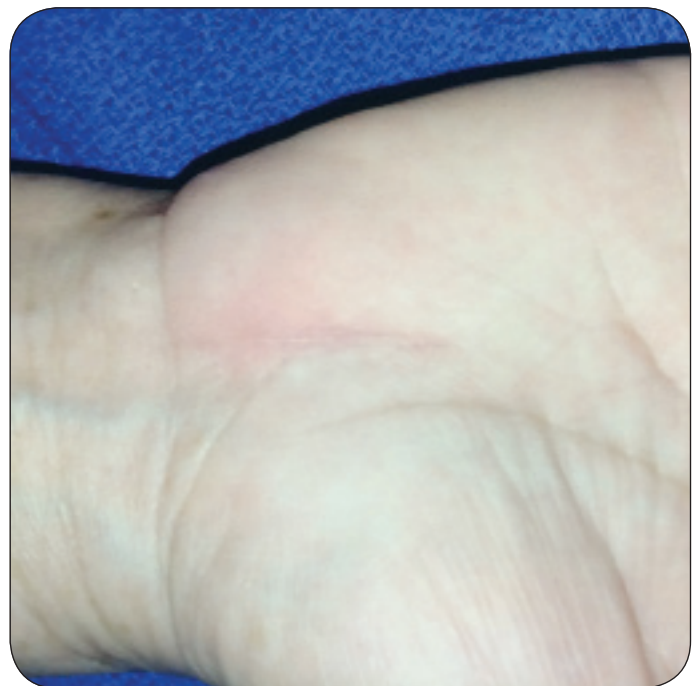
Eight (8) weeks post-AquaRoll® treatment.