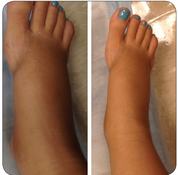
Prior to first Aquaroll® treatment.

After one (1) Aquaroll® session, the pain and swelling was markedly reduced. Patient continued treatment, with a total of three (3) sessions in a one (1) week period. Patient returned to normal activities, including extended periods of standing and walking without discomfort.