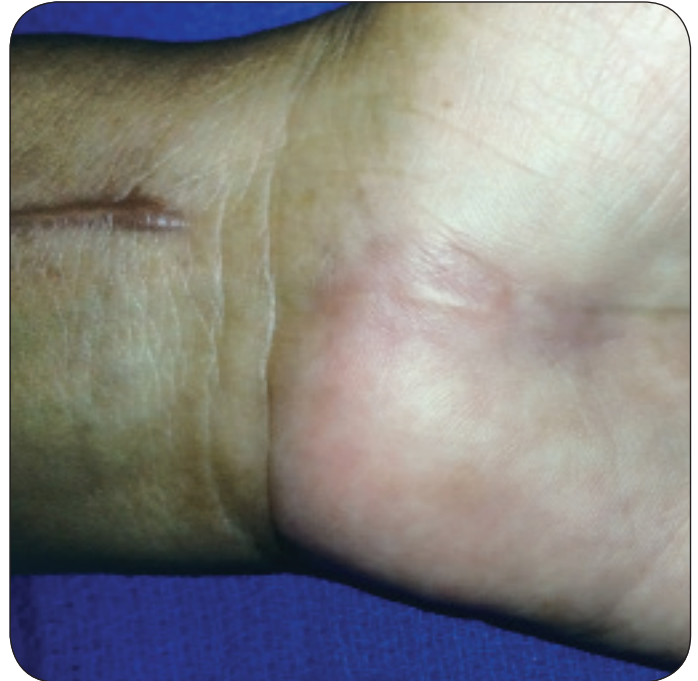
Three (3) months post-operative. Prior to initial AquaRoll® treatment session.

At four (4) months, post-thirty (30) AquaRoll® treatment sessions, Patient had regained good functional range of motion - fifty (50) degrees of volar flexion and fifty-two (52) degrees of dorsiflexion - and was able to establish pulp to palm pinch. Pain had lessened substantially to an intermittent three out of ten (3/10). Scarring was markedly reduced. Patient returned to work.