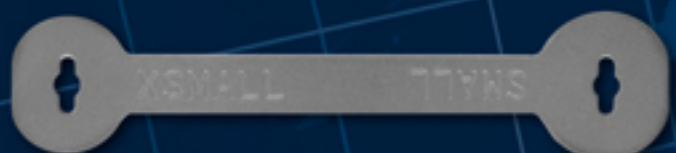
375-0005 EXTRA SMALL/SMALL SIZERS