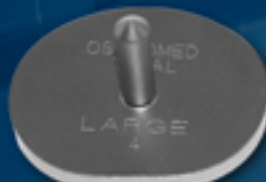
375-0012 LARGE TRIAL