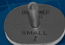
375-0010 SMALL TRIAL