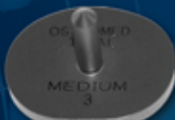
375-0011 MEDIUM TRIAL