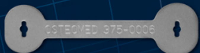
375-0006 MEDIUM/LARGE SIZERS