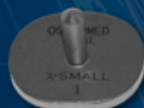
375-0009 EXTRA SMALL TRIAL