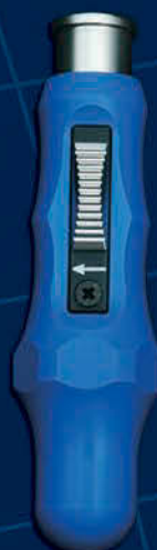
316-0103 2.0/2.4mm TAPERLOCK™ Driver body with ratchet

316-0226 Washer, 4.0mm Cannulated Screws 316-0225 Washer, 3.0mm Cannulated Screws 316-0126 Washer, 2.4mm Cannulated Screws 316-0125 Washer, 2.0mm Cannulated Screws