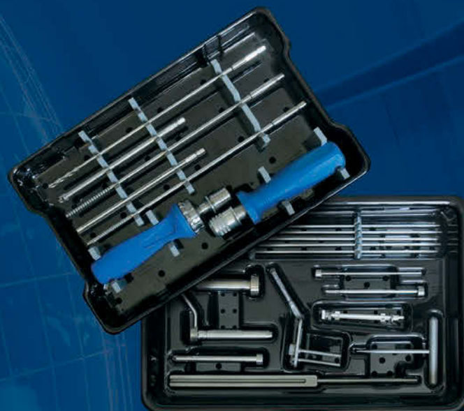
316-0033 6.5mm / 7.3mm Cannulated Tray