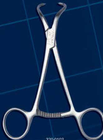
320-0102 Bone Clamp

INSTRUMENTATION FOR 2.0MM 2.4MM 3.0MM 4.0MM