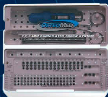
316-0110 2.0/2.4mm Cannulated Screw Organizer Block

Refer to Product Insert for specific indications and Instructions For Use .