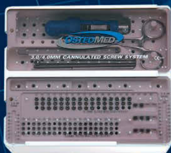
316-0010 3.0/4.0mm Cannulated Screw Organizer Block