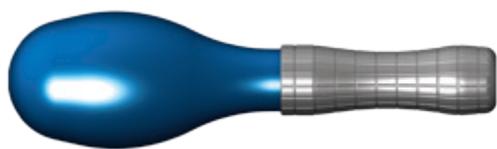
220-0262 Blue Metal Screwdriver Body