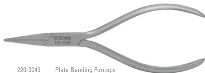
220-0049 Plate Bending Forceps