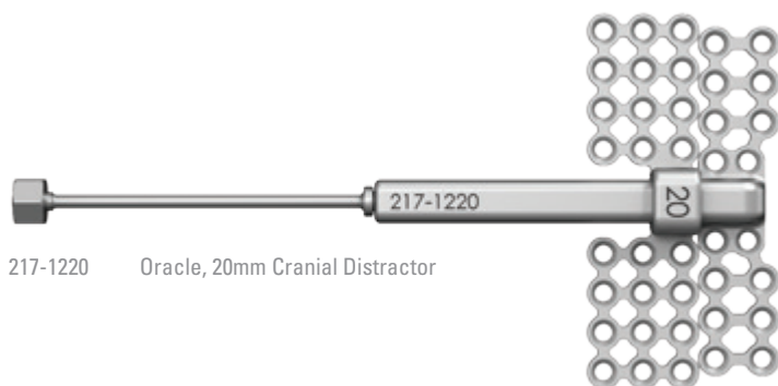
217-1220 Oracle, 20mm Cranial Distractor