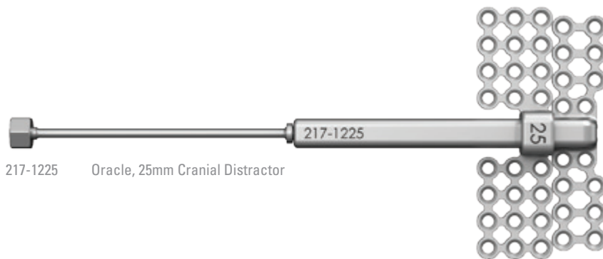
217-1225 Oracle, 25mm Cranial Distractor