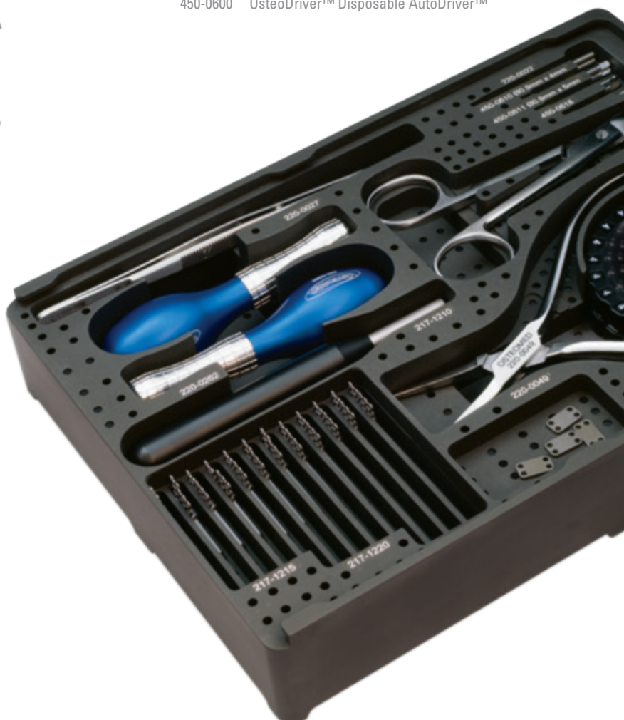
217-1260 OracleDistraction System