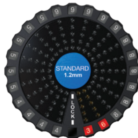
220-1250 1.2mm AutoDrive Visidisk 220-1251 1.2mm Standard Visidisk