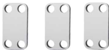
217-1230 Oracle 1.5mm Spacer