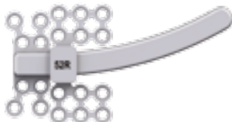
216-1001 LOGIC™ Jr. Distractor, Right 52mm

52mm Straight Left/Right (25mm of distraction)