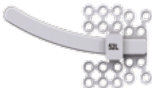
216-1000 LOGIC™ Jr. Distractor, Left 52mm