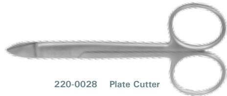
220-0028 Plate Cutter