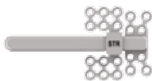
216-1002 LOGIC™ Jr. Distractor, Straight (Left/Right)

52mm Straight Left/Right (25mm of distraction)