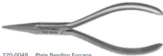
220-0049 Plate Bending Forceps