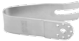
220-0058 Cheek Retractor