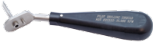
220-0055 Short Pointed Cannula